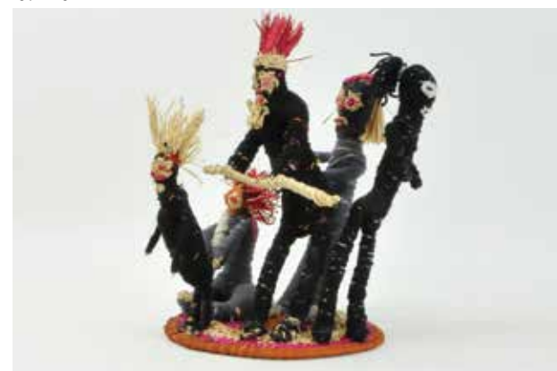
© TJUNKAYA TAPAYA Kutara-ra Two Brothers