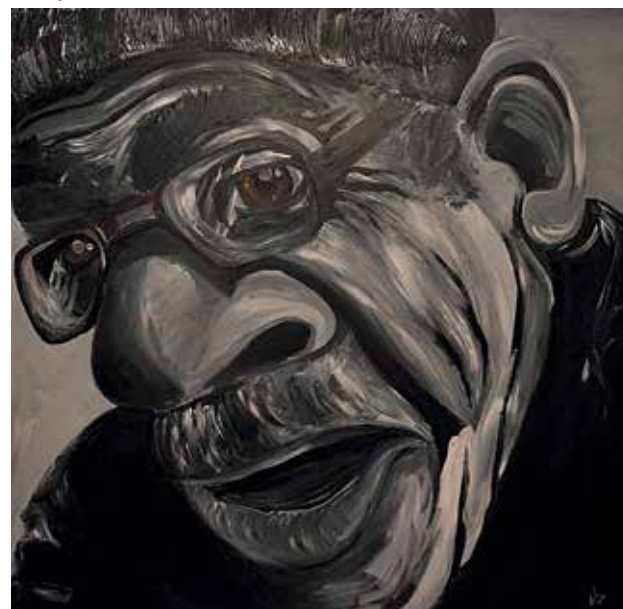
© KAT KNUTH Mourning Your Passing