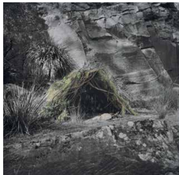
© JAMES TYLOR Un-resettling (half dome hut on a cliff face)