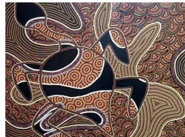
© SAMANTHA SNOW Change and Adaptation