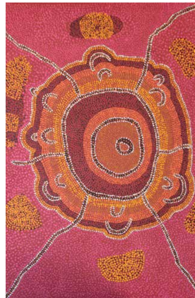
© BILLY LONG Anangu Tjuta (Many Anangu)