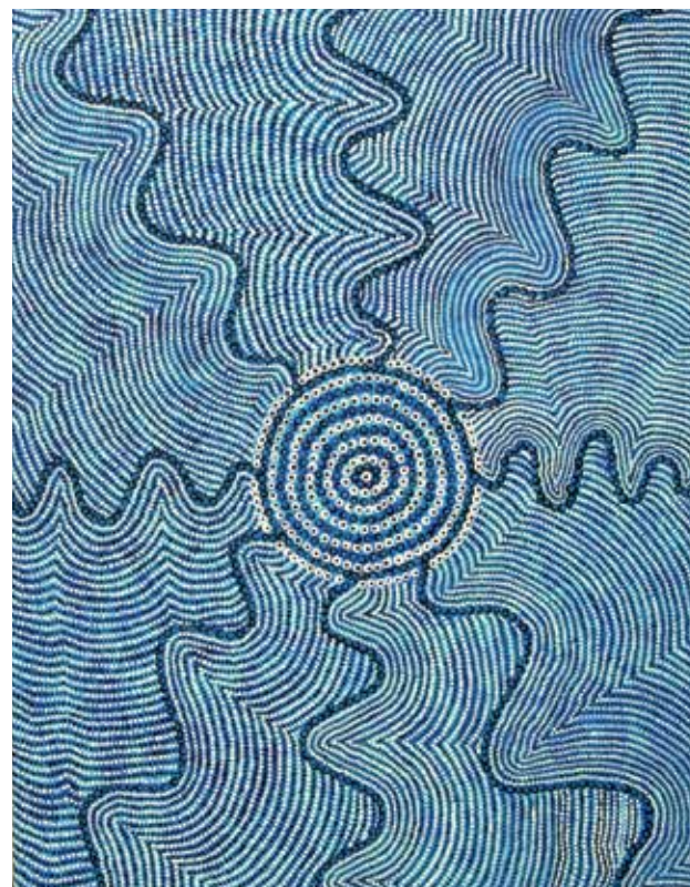
© SHERRIE JONES Reflecting on our Past and Future