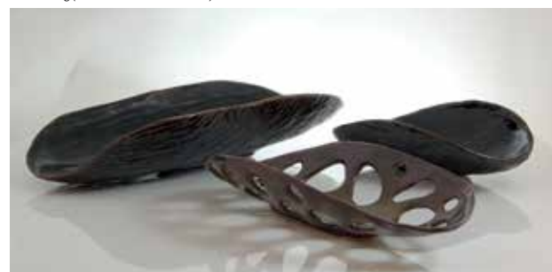
© PETER SHARROCK Coolamons (set of 3)